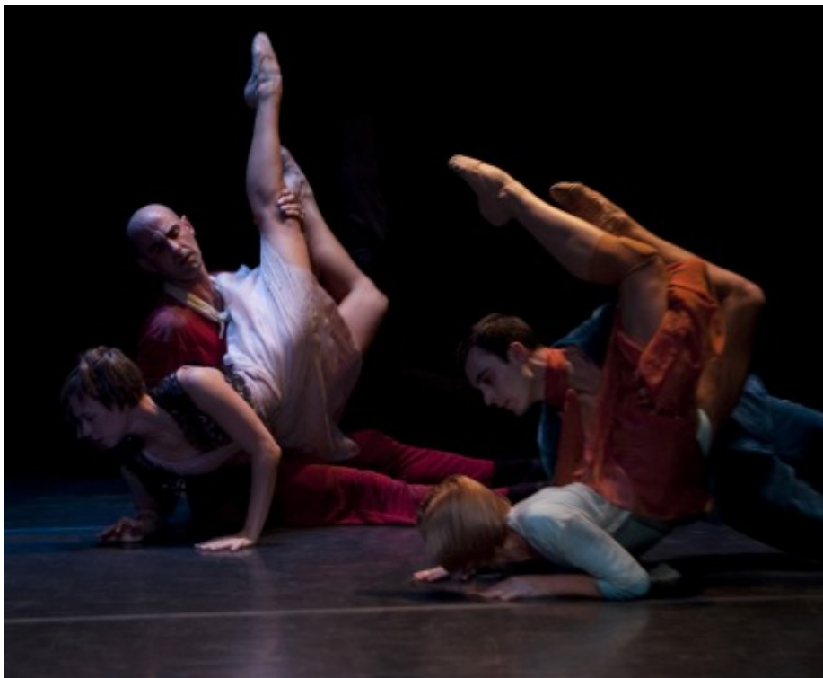
“Transparent Things.”

Transparent Things is a lovely offering to the life of traveling artists. This piece is lively and animated. The additional live quartet on stage adds more of a performance art structure and less a dance alone. The Bryant Park Quartet performs Debussy’s String Quartet in G Minor, Op 10 .