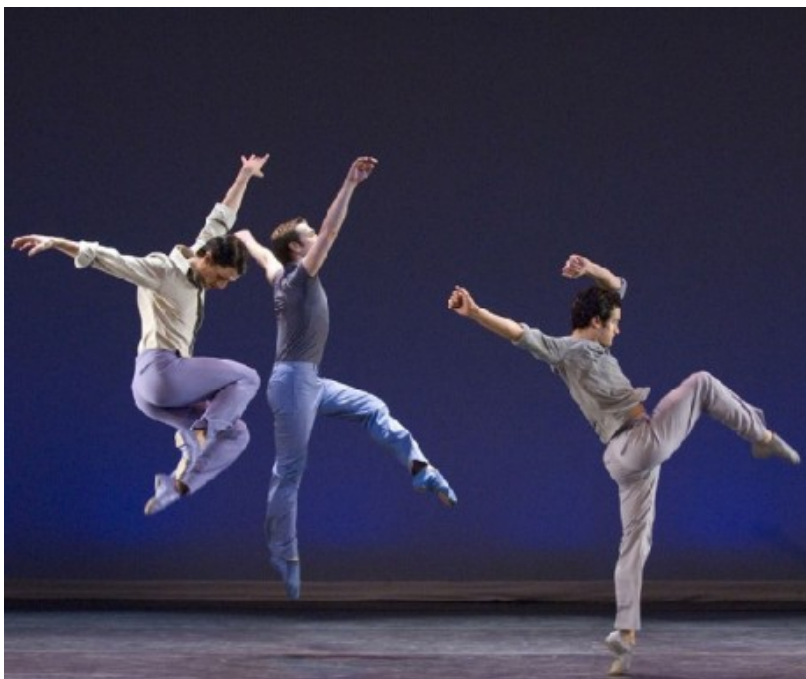
Lar Lubovitch's 'Little Rhapsodies.'

The Legend of Ten (2010) is a dance of ten dancers stepping into the role of cartographers. You may only know this in having read background about the dance otherwise it isn't obvious on stage. The movement itself is wavy and fluid. It is very much about discovering in the moment. The power packed and emotional current of Johannes Brahms' Quintet for Piano, Two Violins, Viola, and Cello in F Minor, Op 34 strongly supported the piece. The dancers themselves, dressed in black with mesh-like tops are bold and elegant. With this opening piece we begin to get a taste for Lar's movement voice, which is a beautifully deep understanding for both classical and contemporary dance.